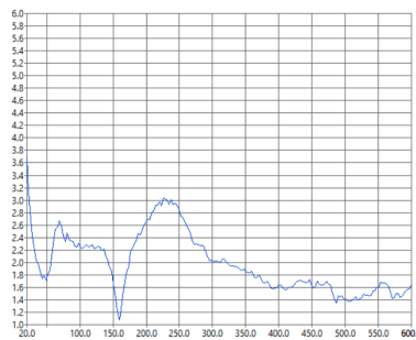
Typical VSWR measured on manpack radio in free space