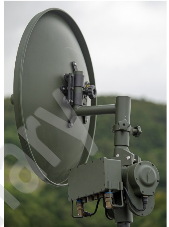
The CAPAS-RT rotator/tilter enables precise control of rotation and tilt angle.

The CAPAS-RT is fully rugged per MIL-STD-810, and is suitable for a wide range of deployable masts, including Comrod TM, LMT and ULM series.