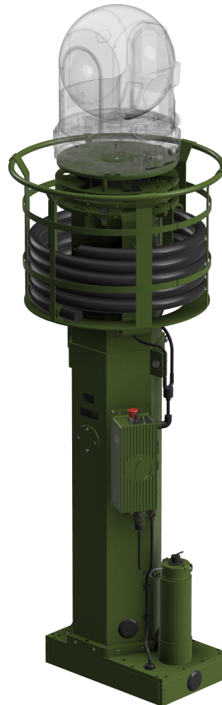
TM250-5.8/1.7 mast in retracted position