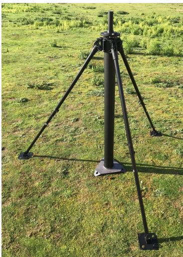
Tripod assembly (option)

* Typical values shown. Actual values will be subject to a combination of top load weight, top load area and pointing accuracy required.