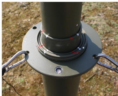
Bayonet tube locking system