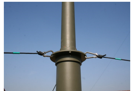
GRP composite tube sections