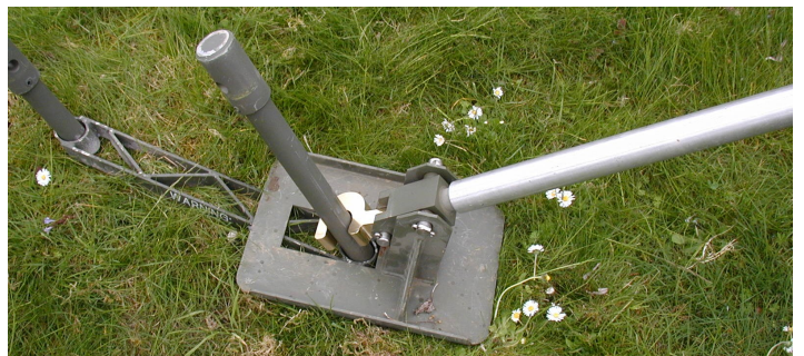
Driving the stake out