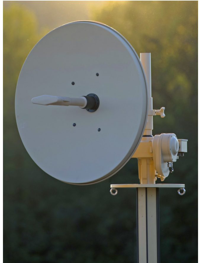
CAPAS -SR rotator with Comrod band 3+ antenna mounted on a Comrod TM210 electro-mechanical mast

CAPAS-SR is fully rugged per MIL-STD-810, and is suitable for a wide range of deployable masts, including Comrod TM, LMT and ULM series.