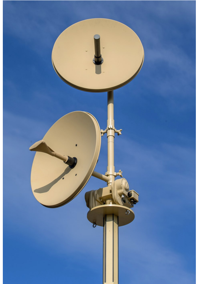
CAPAS-DR with Comrod band 4 and 3+ antennas mounted on a Comrod TM210 electro-mechanical mast

CAPAS-DR is fully rugged per MIL-STD-810, and is suitable for a wide range of deployable masts, including Comrod TM, LMT and ULM series.