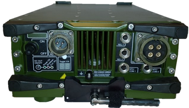
ComPact 2400 AC/DC Power Supply mounted onto vehicle bracket