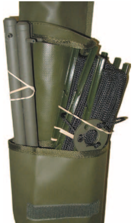
Contents of front pocket