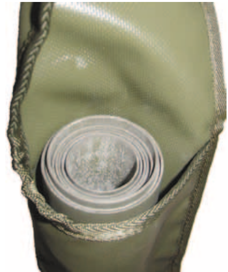
All tubes are stored into each other