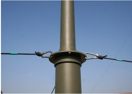
GRP composite tube sections