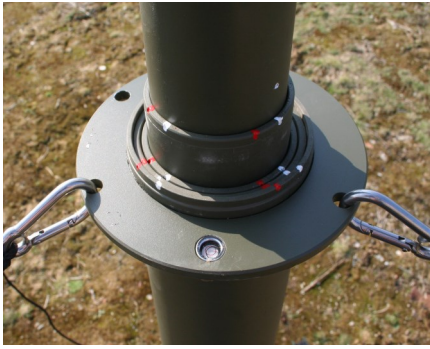
Bayonet tube locking system