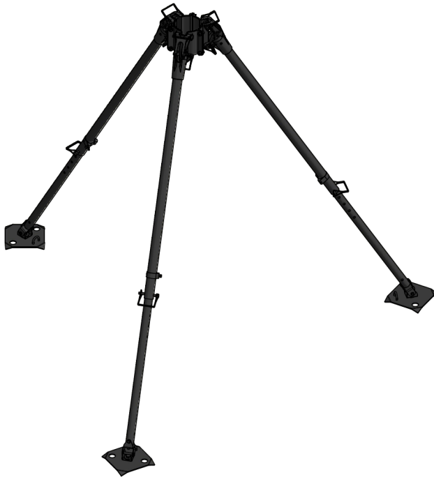
Optional tripod to support mast during deployment. Adjustable legs allow for deployment on uneven ground