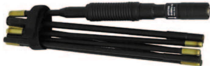
Whip shown folded for stowage