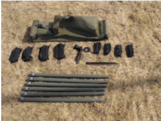
AMX54 Mast Extension Kit

* Subject to top load wind surface area.