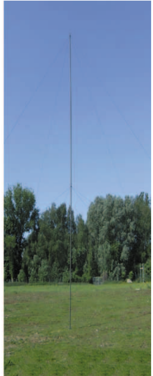
AMX54 Mast with AMX54 Mast Extension Kit 9 metre mast with 4 way 2 level guying