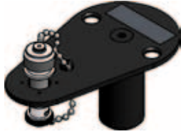
Antenna mounting bracket TNC antenna interface BNC connector 24 mm spigot

Mounting brackets are available to mount Comrod antennas on the AMX54 mast.